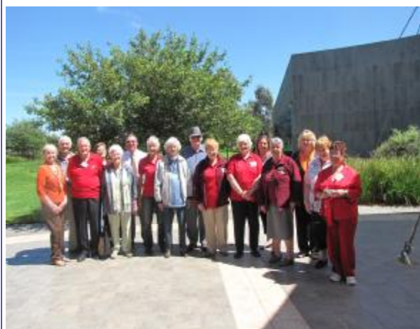
Tourism Volunteers Tour 2010

Whittlesea Courthouse Visitor Information Centre is located on the cnr of Beech & Church Streets, Whittlesea 9716 1966